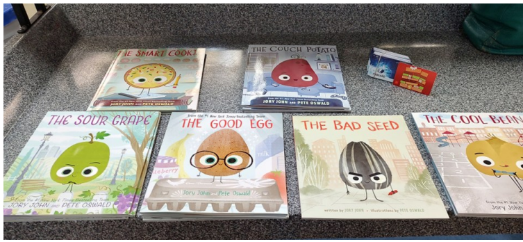
Suds and Stories held at Garden Island Laundromat - fun time was had by all, regardless of the snow! Thanks to Kevin and the crew and all the volunteers who read to the children.